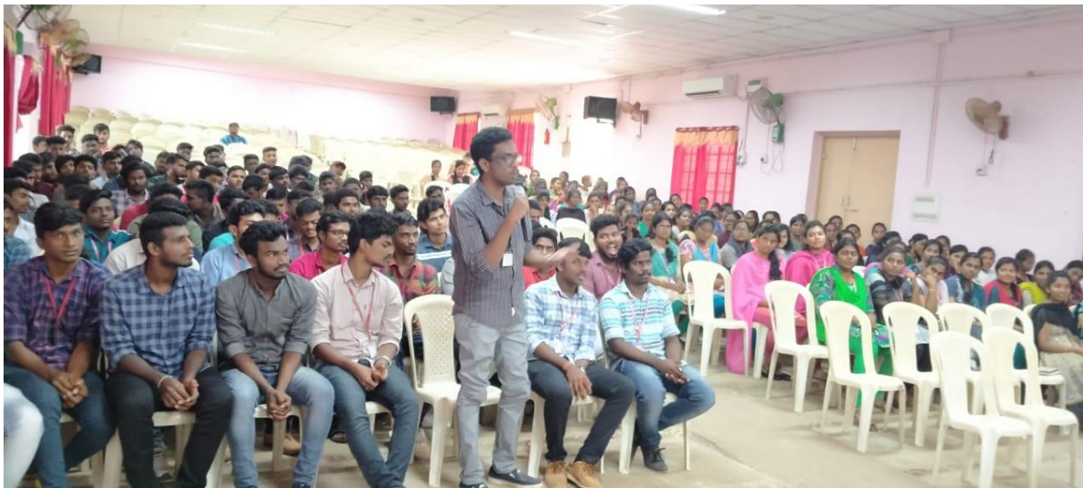
Seminar on Digital marketing (on/off page optimization) for II, III, IV year students