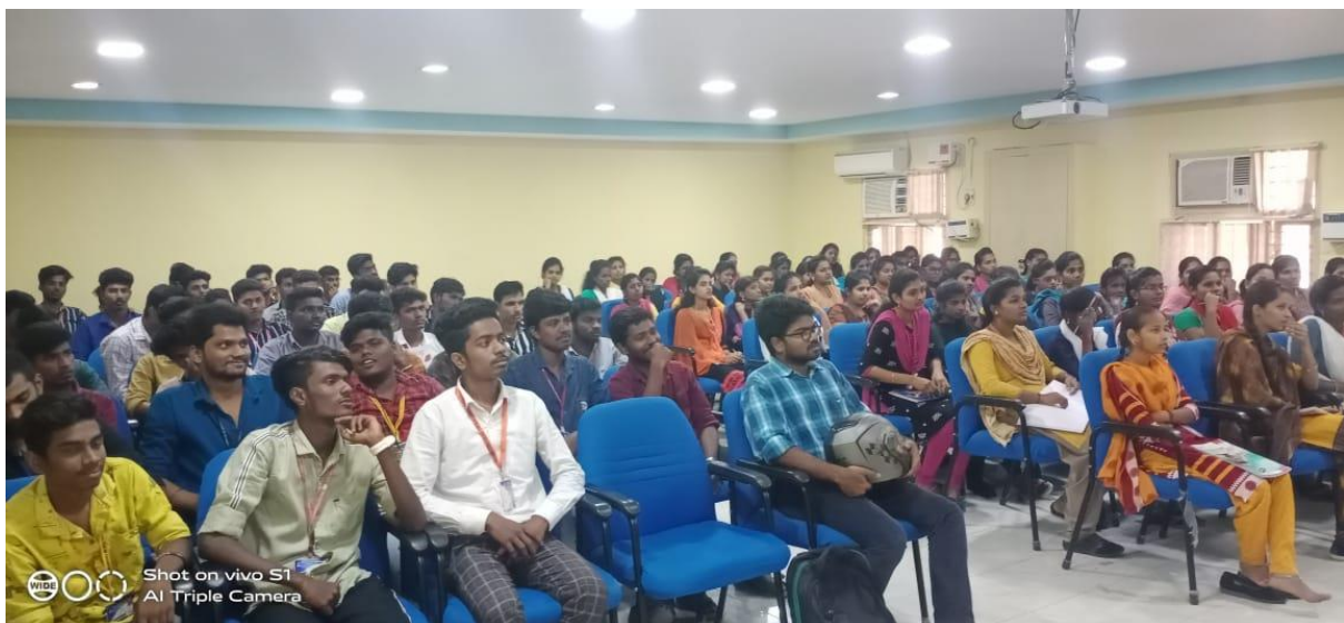
Seminar on IOT implementation and Embedded Basics for III year students