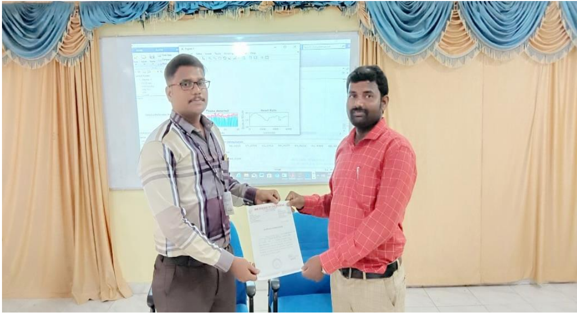
Seminar on machine learning applications in signal processing for II, III year