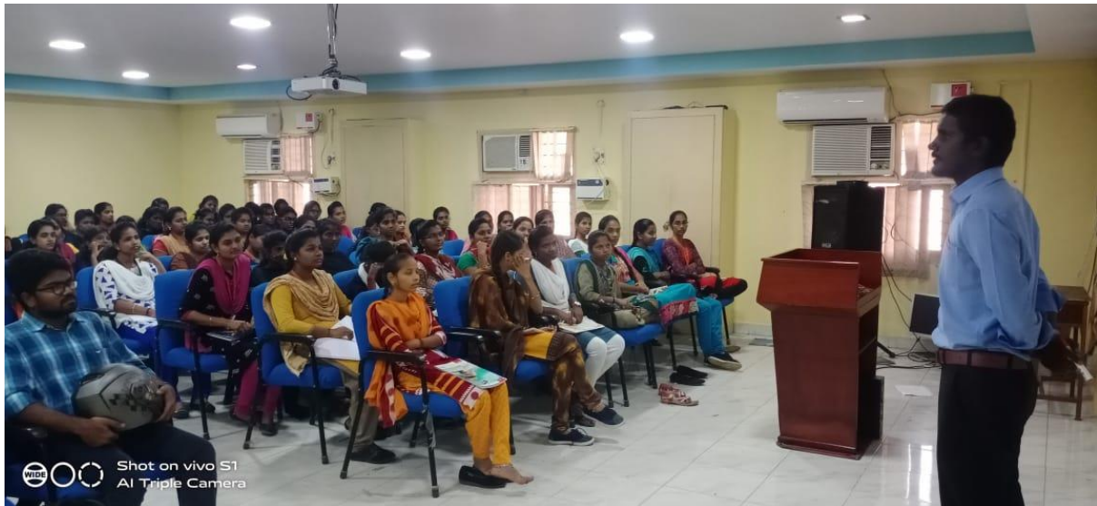
Seminar on IOT implementation and Embedded Basics for III year students