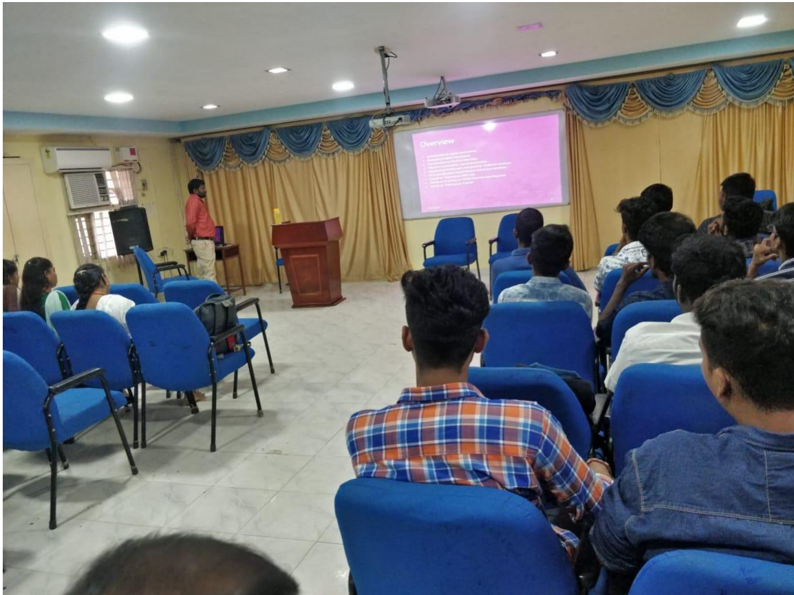
Seminar on machine learning applications in signal processing for II, III year