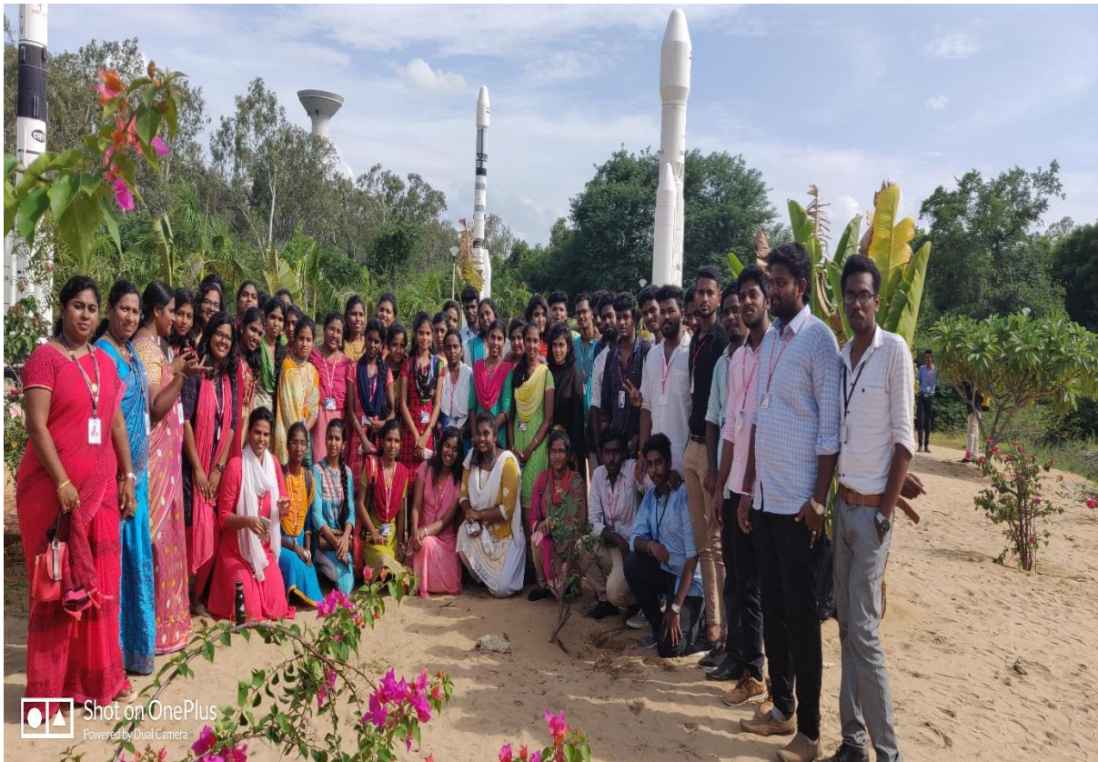
Industrial visit to Indian Space Research Organization (ISRO), sriharikota for IV year ECE students on 05.09.2019

The department of ECE organized an industrial visit to Indian Space Research Organization (ISRO), sriharikota for IV year students on 05.09.2019.