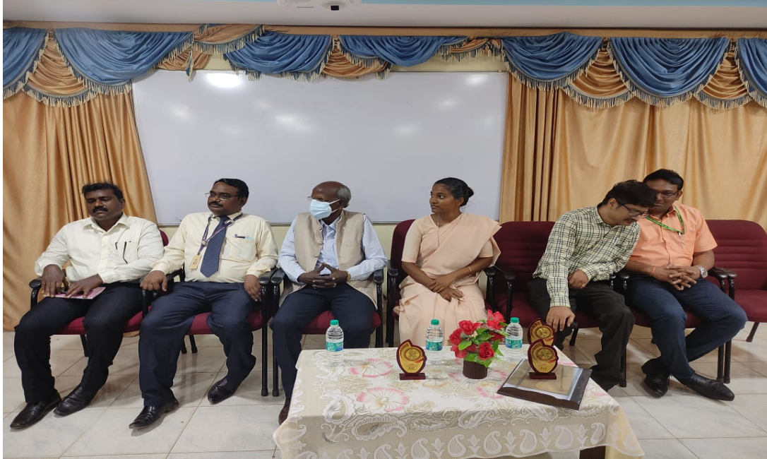
Guests along with our Administrator on the dais