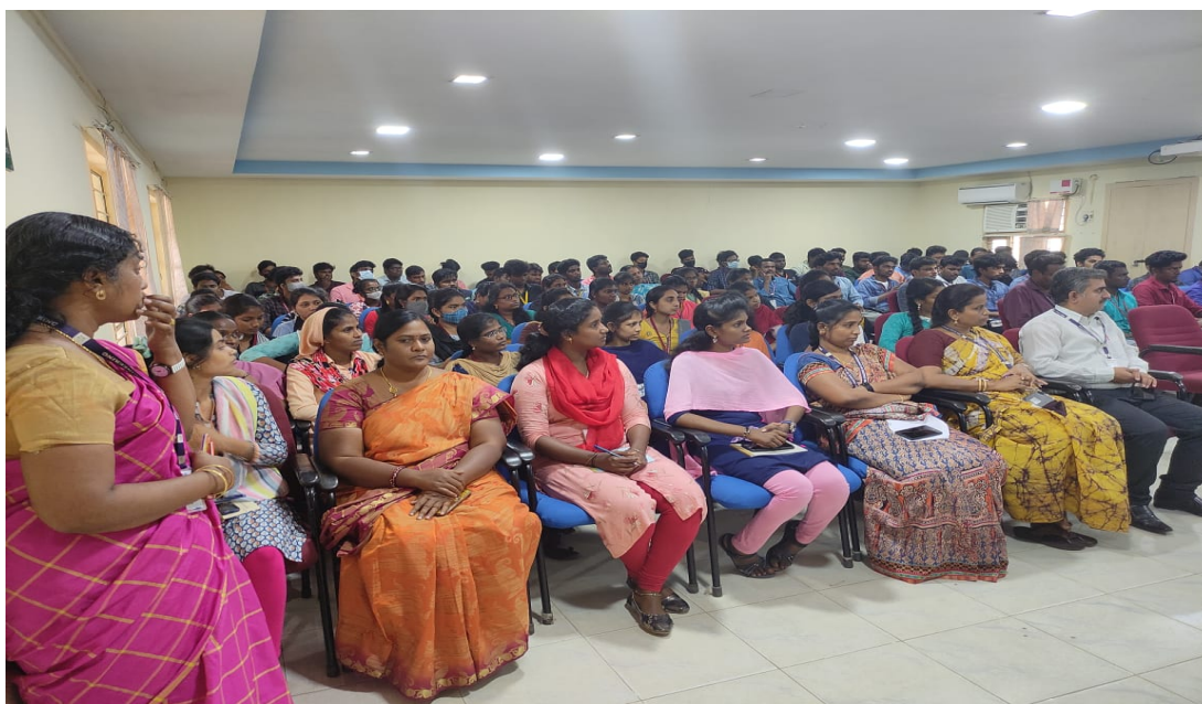
Student, staff and HODs attending the seminar