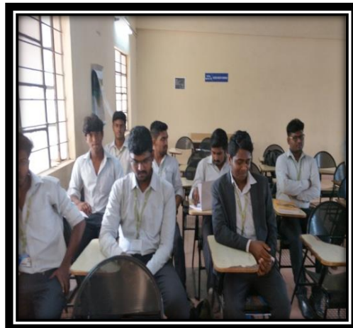
Management Activity – Face game