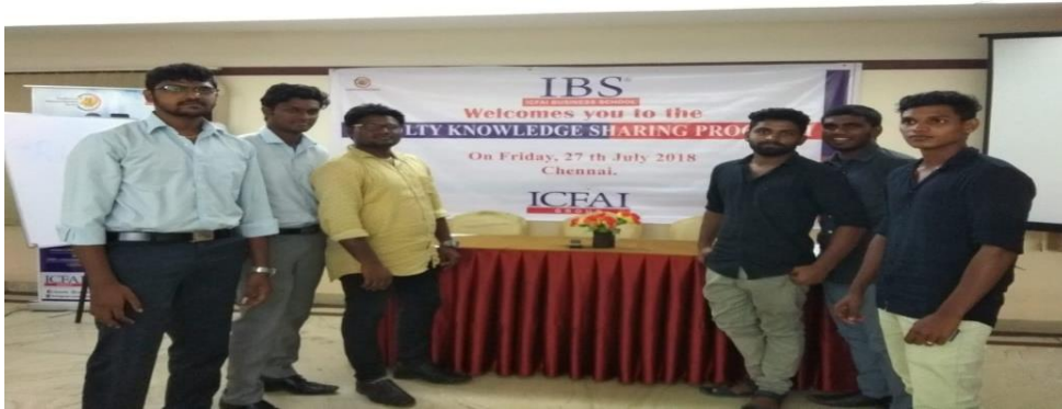
Seminar – MBA and Managerial Effectiveness

to succeed, building trust with colleagues and clients, enhancing your skill-set and commanding a higher salary, etc.