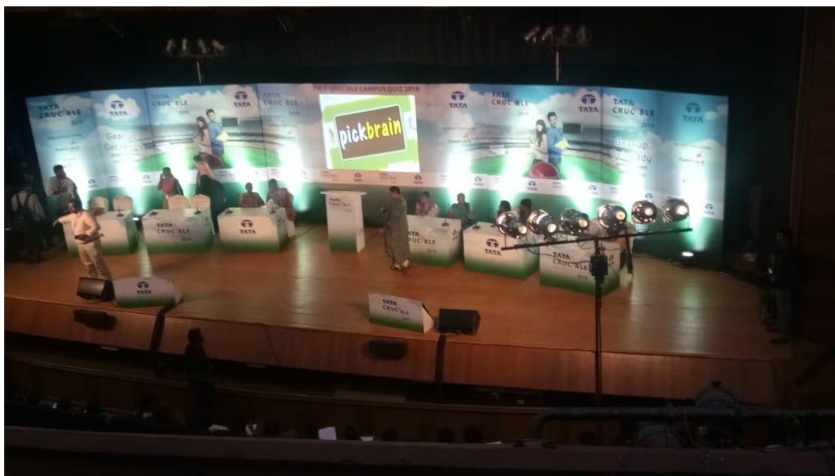
First year MBA students have participated in the “PICK BRAIN -TATA CRUC BLE” Quiz Competition on 05.03.19 at Music Academy, Gopalapuram, Chennai.