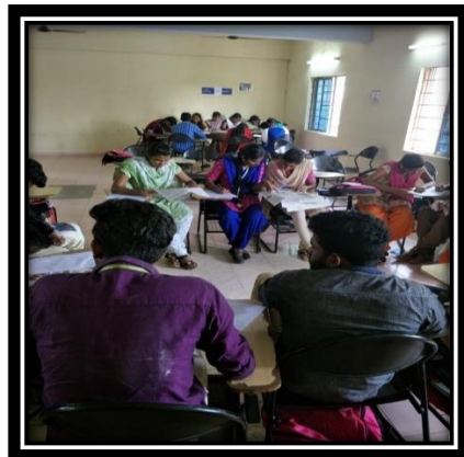
Orientation – Bank Exam Preparation