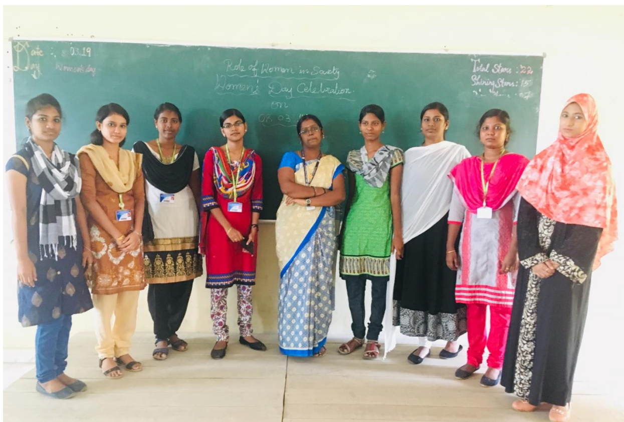
Women's Day Celebration conducted for girls students on the topic “Role of Women in the society”. Students were participated and shared their views on 08.03.19.