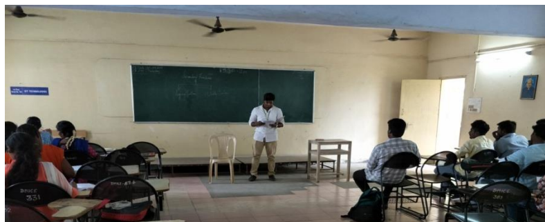
Presentation - How to dress for the corporate culture