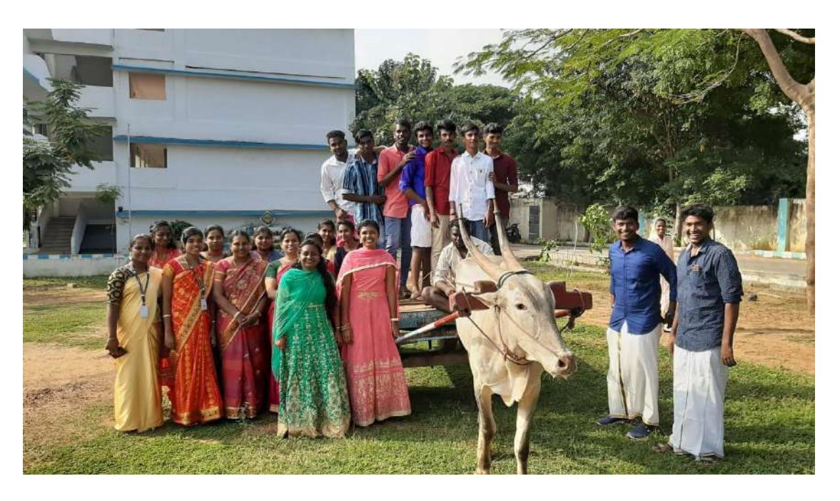
Students took a joyful ride in the bullock cart

Student of III year ECE, Tamilkanal received the trophy for Stripping the pot (uriadi) from Dr.Belsam